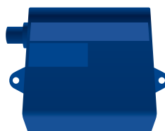
Hardware box (Heras Cloud Unit)