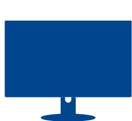
Heras cloud portal